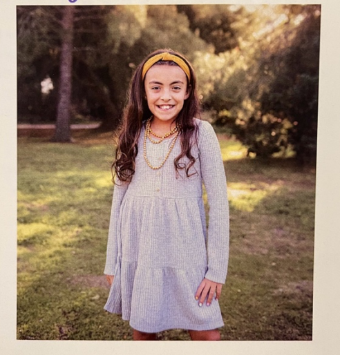
September 10, 2010 - November 10, 2021